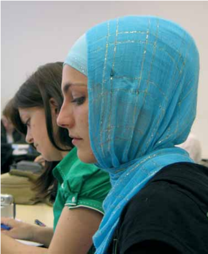
Students, IUC 2008

Unlike over the past 5 years, this year's students' evaluations were not anonymous. All the students publicly stated their opinion about one-week-work based on the model "2 plus 2: I liked 2 the most, I did not like 2 the most." Students' evaluations below are in their original form, without any change.