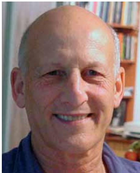
October 3, 1938 Haifa-September 4, 2008 Tel Aviv