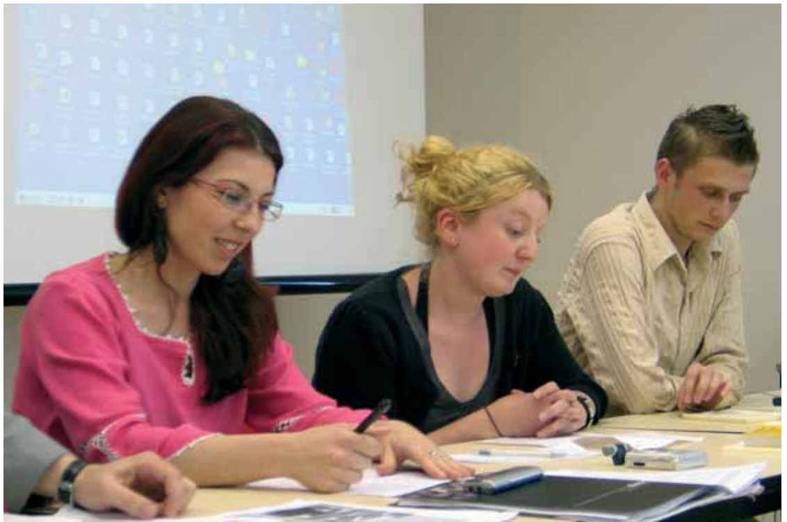
Students, IUC 2008