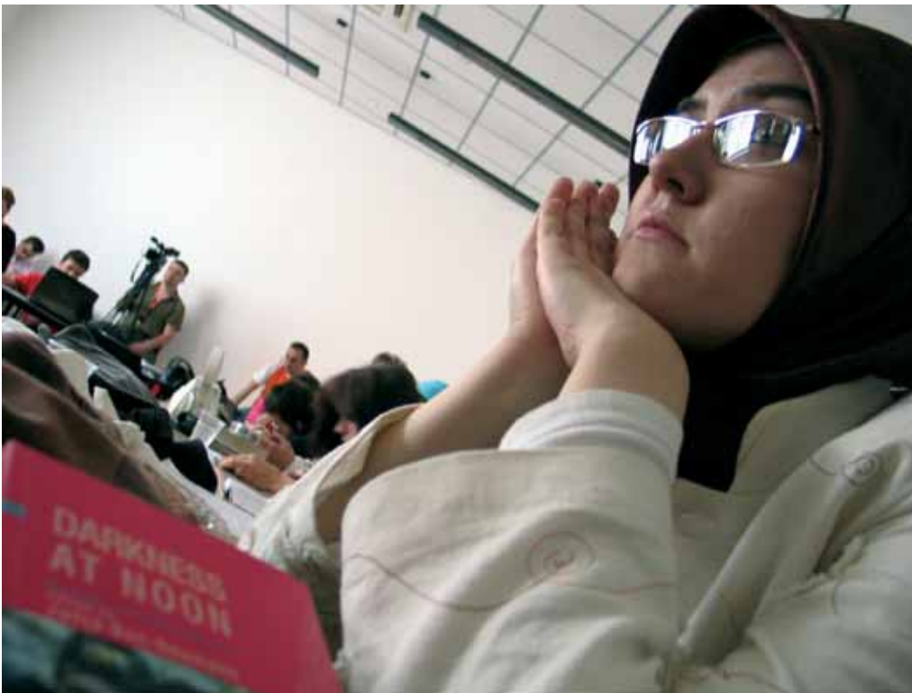
Students, IUC 2008